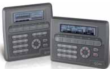
The two newcomers E1012 and E1022 complement the range of E1000 operator terminals.

The E1000 is compatible with existing E series HMI solutions including the wide range of over 100 different drivers. This extensive library of drivers make the E1000 "open" for connection to industry leading PLCs, inverters, servo systems, networks and specialist control solutions from a wide range of industry leading manufacturers.