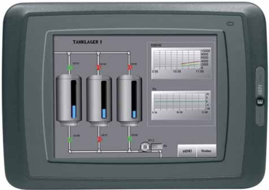
Touch-Screen terminal, tough Aluminium casing - stands up to the industrial work place

A USB host is available allowing you to add standard PC peripherals such as keyboard, mouse, printers and USB memory to your local E1000 operator terminal (not for E1012 and 1022).