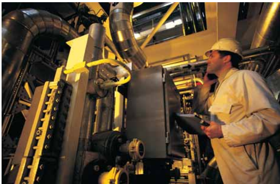
HMI terminals make maintenance easier by giving access to all information from one point.