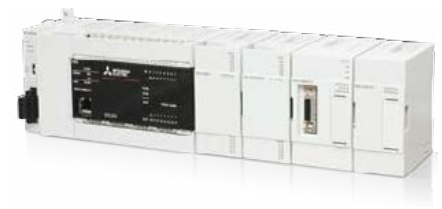
Add-on modules to meet your needs

The FX5U offers a range of troubleshooting functions to speed system set-up, increase system availability and reduce maintenance requirements. Comprehensive debugging functions are included, along with improved diagnostics functions. Simple maintenance is facilitated through improved diagnostics including error history, hardware monitor, SD card for logging & tracing functions, automatic system recognition and several program debugging functions.