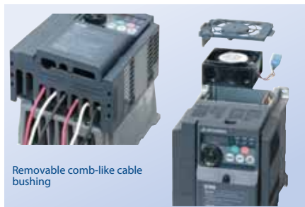
Cabling and fan replacement made easy

The fans are designed as compact units that can be replaced in less than 10 seconds for cleaning or in the event of failure.