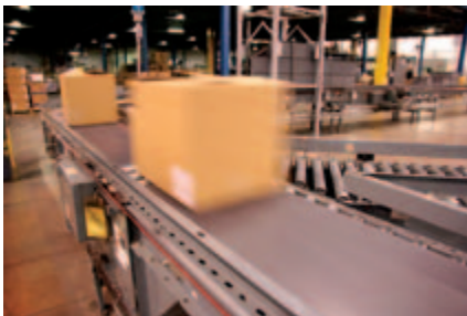
Fast processors due to short response times.