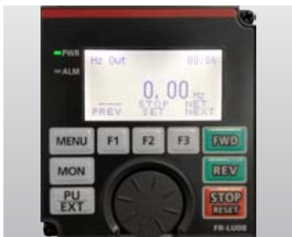
FR-LU08 as full text display with up to fifteen language and real time clock.

The operation panel with the one touch Digital Dial allows direct access to all important parameters. Select the operation panel ideal for your needs. Choose either a LU operation panel with an LCD screen offering enhanced display functionality and a clock function, or a more economical DU operation panel with a 5-digit, 12-segment display.